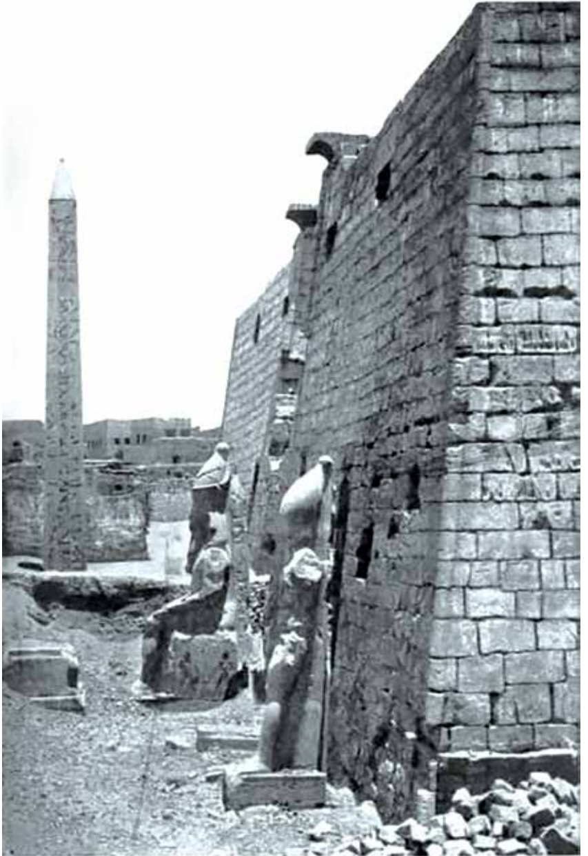
THE GREAT GATE OF THE TEMPLE OF LUXOR, WITH OBELISK.